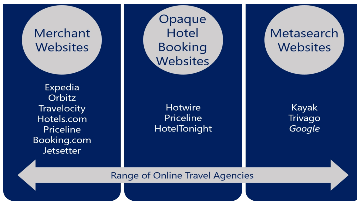
Pros and Cons of OTAs Range from Expanding a Hotel's Exposure to Lower Profits