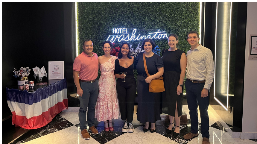
HRES, Hotel Washington Event