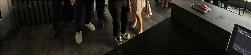
HRES Group, VUE Bar, Hotel Washington