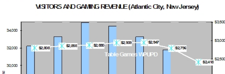
Chart 1 – Atlantic City Visitation and Gaming Revenue (2004-2008)

From 1992 to 2008, as gaming revenue has grown, total win per visitor as grown. As discussed in the previous section, Atlantic City visitation has grown modestly from 1992 to 2008. Gaming revenue increases have spurred revenue per visitor growth for the majority of the period shown. Total win per visitor peaked at $151 in 2006, prior to the impact of Pennsylvania gaming, which largely affected 2007 and beyond. As reflected in 2007 and 2008 declining revenue, win per visitor began to decline in these respective periods.