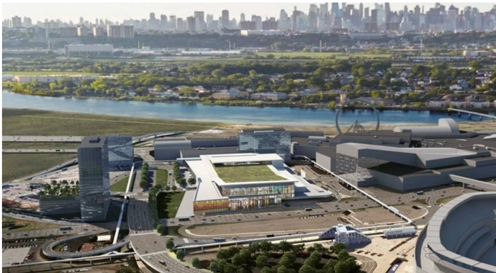
Rendering of the Proposed Convention Center Complex

Local officials are enthusiastic about this opportunity to reinvigorate the Meadowlands and northern New Jersey.