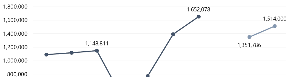
LIR Passenger Traffic Far Surpasses 2019 Level and Continues to Grow