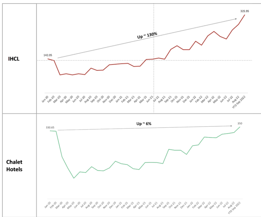
Monthly Closing Share Prices (Jan 2020 – YTD 21 st Sep 2022)

Due to the improving fundamentals and industry performance, stocks of major listed hotel companies in the country have seen a strong revival in recent months, reflecting the changing fortunes of the Indian hotel industry and a revival of investor interest in the sector. In fact, IHCL is the single largest gainer across all hotel stocks globally since the pandemic.