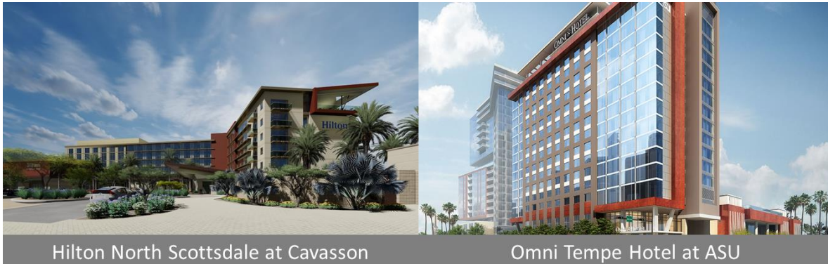
Hilton North Scottsdale at Cavasson

However, new supply, construction/renovation costs, and the cost of capital remain concerns in the market. All eyes are set on Phoenix given its expected supply increase of nearly 20% with more than 120 projects over the next five to seven years. The market is trending behind only Nashville, Tennessee, in terms of hotels in the planning, final planning, and construction phases of development as a percentage of existing supply. In recent years, strong growth in supply has occurred in both the East and West Valleys of Phoenix. Some recent hotel openings include the 237-room Hilton North Scottsdale at Cavasson , which opened at the start of this year, and the 300-room Omni Tempe Hotel at ASU , which opened in April 2023 and features over 35,000 square feet of meeting space.