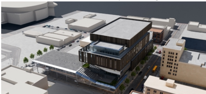
Wichita Biomedical Campus Rendering

Going forward, demand levels in this market are expected to remain strong given several development projects that will break ground in 2024. The largest planned development in the area is the WSU/ University of Kansas Biomedical Campus in Downtown Wichita. This $300-million facility is expected to open in 2026 and will bring 3,000 students and 200 faculty and staff to Downtown Wichita. Furthermore, the Sutton Place building is currently being redeveloped into student housing that will be attached to the medical school via skywalk.