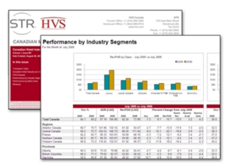
Click snapshot to view most current report

STR's Hotel Reviews have long been considered a must-read for anyone involved with the hotel industry. Each issue offers the accurate, timely industry data you require to stay up-to-date in an ever-shifting world market. Now, in addition to the acclaimed U.S. Hotel Review and our Global editions, STR is proud to offer this useful publication for Canadian markets.