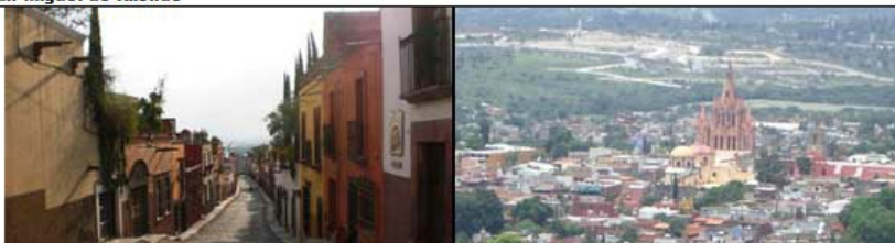
San Miguel de Allende