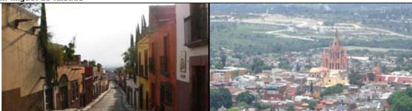
San Miguel de Allende