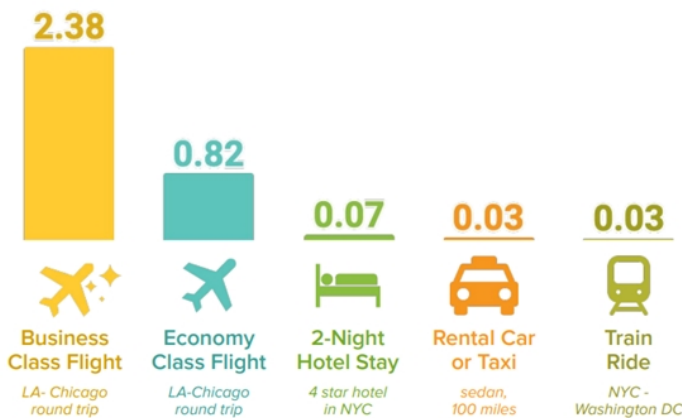
Authorized use of graphic from Sustainable Travel International