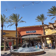
Desert Hills Outlet Mall and Cabazon Outlets (30 minutes from Palm Springs)

There are so many hotels to choose from, from small historic inns in the heart of Downtown Palm Springs to the vast resorts of Indian Wells and Palm Desert, with rooms at every price point. My recent favorites include La Serena Villas , L'Horizon , and The Parker , but I've had so many other excellent stays in Palm Springs at other hotels over the years. Depending on your budget and neighborhood choice, you're sure to find a great stay option. Palm Springs also has some fantastic hotels that cater specifically to the LGBTQ+ community, as well. I'm happy to narrow a list with you depending on what kind of experience you are seeking; just connect with me.