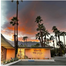
The Shops at Thirteen Forty-Five – a must stop!