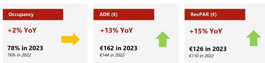
Chart 1: 2023 Serviced Apartment Performance Led by Average Rates

The following chart presents an overview of the recent average rate and RevPAR performance in Europe, as provided by the main Serviced Apartment operators in the market.