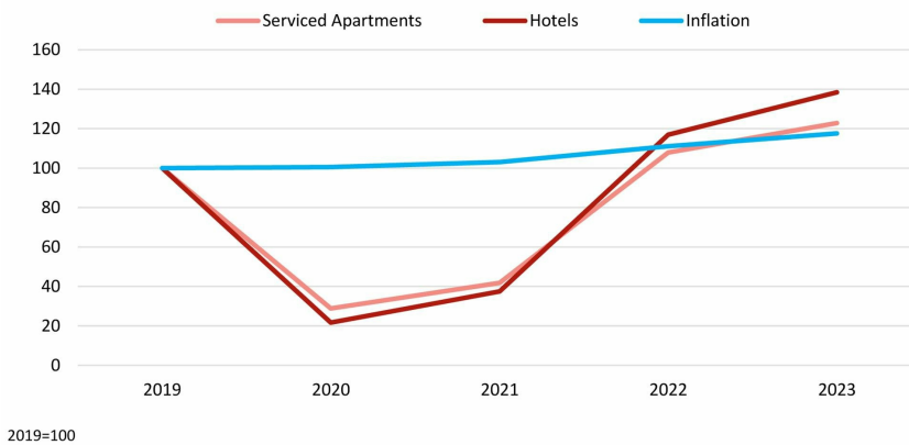
Chart 3: Influence of the Luxury Sector – Serviced Apartments vs Hotels in Capital Cities – 2019 Indexed (€)

Focusing on the performances observed in capital cities, we notice a small disparity with the wider sample. Whilst the performances of serviced apartments in the European capitals follow the trends of the overall sample, the performances of hotels in a few capital cities have observed stronger growth in average rates than in the rest of the country. This was due to a combination of the influx of luxury properties and above-average rate growth in this hotel category, thus elevating the overall performances for hotels. This contributes to the distorted impression that hotels might be doing better than serviced apartments.