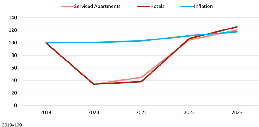
Chart 2: RevPAR Grows Above Inflation in 2023 – Serviced Apartments vs Hotels – 2019 Indexed (€)

The responses to our operators' survey, and confirmed in our analysis, indicate that in 2023 occupancy remained below pre-pandemic levels. However, as with the wider hospitality industry, serviced apartments benefited from impressive average rate growth over the last few years. From our analysis and compared to the inflation of countries our sample properties are located in, we estimate that, since 2019, the average rate and RevPAR of both hotels and serviced apartments have, on average, grown above inflation. In real terms, the average rate of serviced apartments caught up with inflation in 2022 and exceeded it in 2023, allowing RevPAR to also grow in real terms, despite occupancy not having fully stabilised yet. Our analysis shows that the 2023 rates for serviced apartments are more than 6.5% ahead of 2019, in real terms. However, we note that over the same period hotels show 11% growth in real terms, higher than serviced apartments.