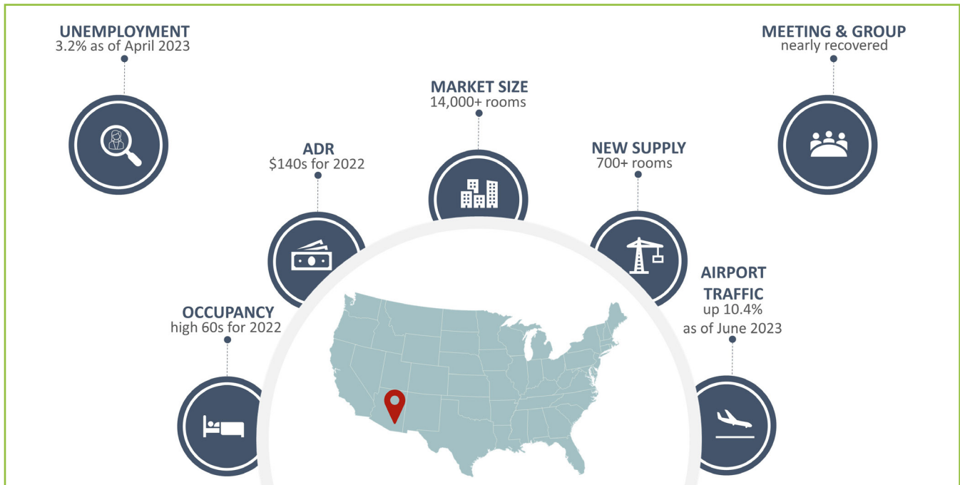
Tucson and Pima County Market Statistics as of Q2 2023