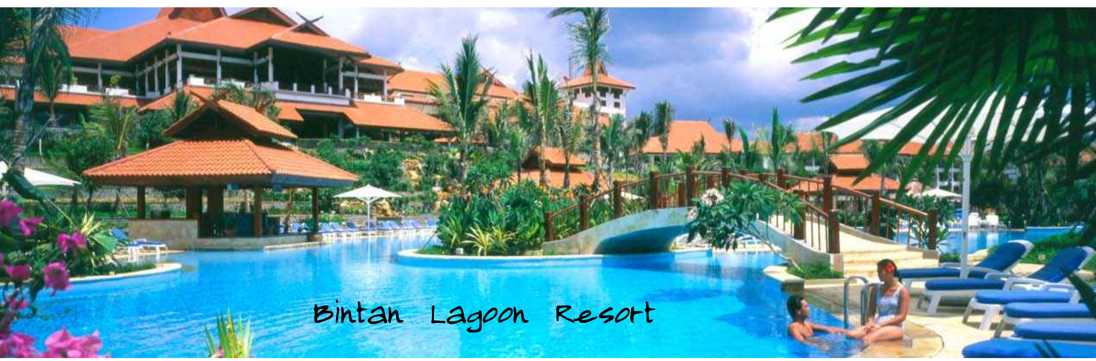
Bintang Lagoon Resort